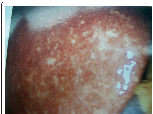
Figure 1 Laparoscopic image of the liver showing diffuse whitish-gray plaque without nodularity or cirrhosis.

On day 3 of her hospitalization, she underwent a pericardial window, a pericardial biopsy and a laparoscopy with liver biopsy. The laparoscopy revealed a grossly abnormal liver (Figure 1). The liver biopsy demonstrated a dense portal lymphoplasmacytic infiltrate with multifocal zones of hepatocellular centrilobular necrosis